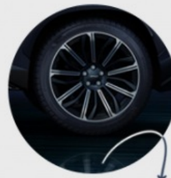
20 inch wheel 255/45 R20