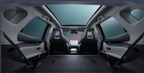
Ultra wide Angle panoramic canopy