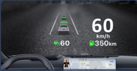
HUD head-up display system