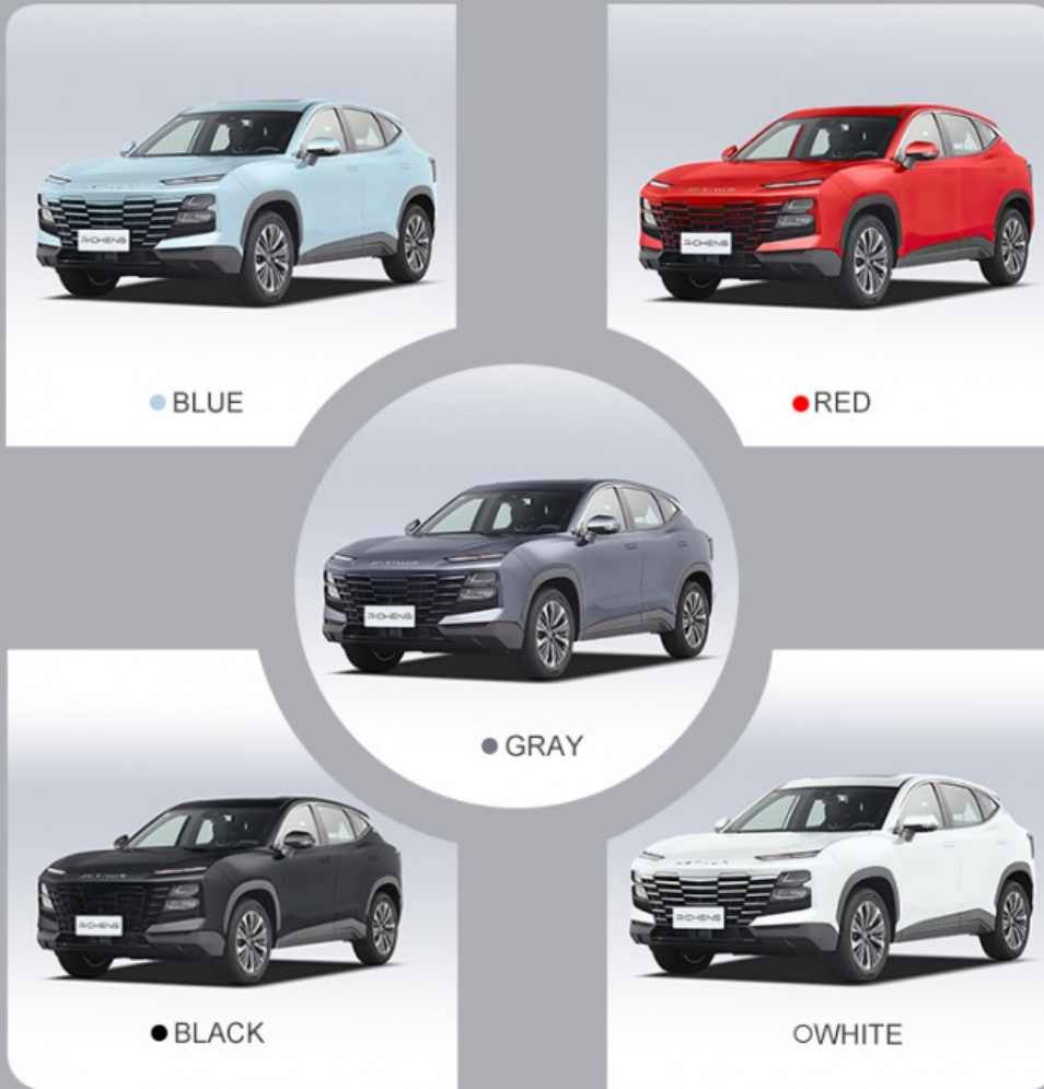
2023 Chinese Jetour Dashing 5 Door 5 Seats SUV 1.6T DCT Jetour Gasoline Car