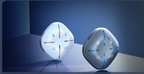
Rubik's Cube Key