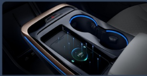
50W wireless fast charge