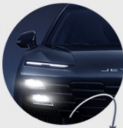
Streamer's wings LED headlights