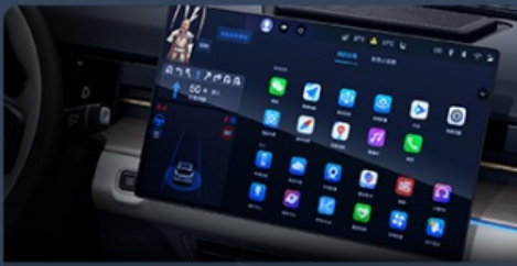
15.6 inch suspension smart screen