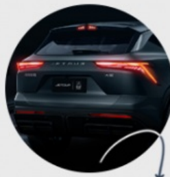
Halberd LED taillight