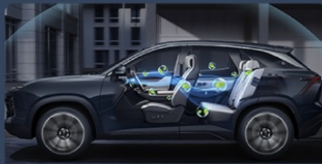
Cabin ecological purification system